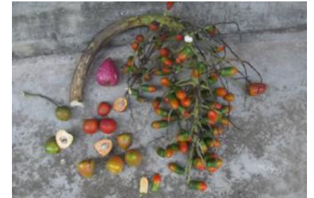
Peach Palm & A Malay Apple

We spent yesterday (January 23 rd ) packing, as well as working in the gardens/plant nursery, school, and office. We are praying for good weather. In the past rain has prevented holding clinics as well as complicated travel on the dirt